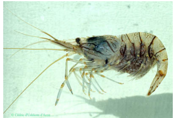
Figure 4. Palaemon elegans Rathke, 1837. Identification and photograph – Cédric d'Udekem d'Acoz

4) Palaemon elegans Rathke, 1837 (Figure 4) inhabits vegetated areas (Dalla Via 1985) and is widely distributed in European coastal waters from the Black Sea, Mediterranean Sea, North Sea, to the Atlantic shores of Norway. In the 1950s it was accidentally introduced to the Aral and Caspian Seas (Zenkevich 1963). However, its distribution in the Baltic Sea has remained unclear. In some publications (e.g. Janas et al. 2004) it was erroneously reported, based on data from Balss (1926), that this species has since the 1920's been