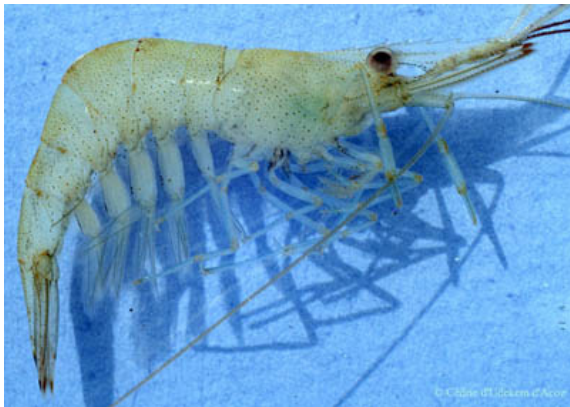
Figure 2. Palaemon adspersus Rathke, 1837. Identification and photograph – Cédric d'Udekem d'Acoz

2) Palaemon adspersus Rathke, 1837 (Figure 2) is an euryhaline species of wide Mediterranean-boreal distribution. In the 1930s and 1980s it was introduced into the Caspian Sea, and in 1950s into the Aral Sea (Holthuis 1980, Jażdżewski and Konopacka 1995, Zenkevich 1963). The species is known from almost the entire Baltic Sea, including the Gulf of Finland (Balss 1926, Knipowitsch 1909, Kotta et al. 2003, Köhn and Gosselck 1989, Silfverberg 1999), and the southern parts of the Gulf of Bothnia to 61°10' N (Väinola pers. comm.). It inhabits littoral, vegetated habitats, and is an omnivorous species (Jażdżewski and Konopacka 1995, Köhn and Gosselck 1989).