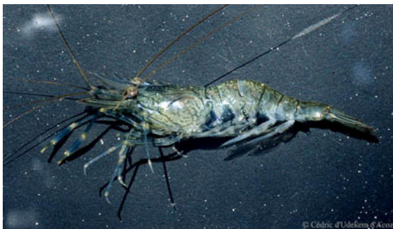
Figure 3. Palaemon longirostris H. Milne Edwards, 1837. Identification and photograph – Cédric d'Udekem d'Acoz

3) Palaemon longirostris (H. Milne Edwards, 1837) (Figure 3) is originally an East-Atlantic species, occurring usually in estuaries, in brackish-water conditions but also noted from adjacent freshwater bodies. Until the end of the last century the species was not recorded in the Baltic Sea (Köhn and Gosselck 1989). In 1999, Zettler (2002) found it in the brackish Darss-Zingster Bodden-