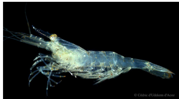
Figure 1. Palaemonetes varians (Leach, 1814). Identification and photograph – Cédric d'Udekem d'Acoz

Köhn and Gosselck 1989) and in the Dead Vistula (Martwa Wisła) in the Vistula estuary (Jażdżewski and Konopacka 1995, Ławinski and Szudarski 1960). Some general information on its occurrence in the adjacent Gulf of Gdańsk was also given by Köhn and Gosselck (1989).