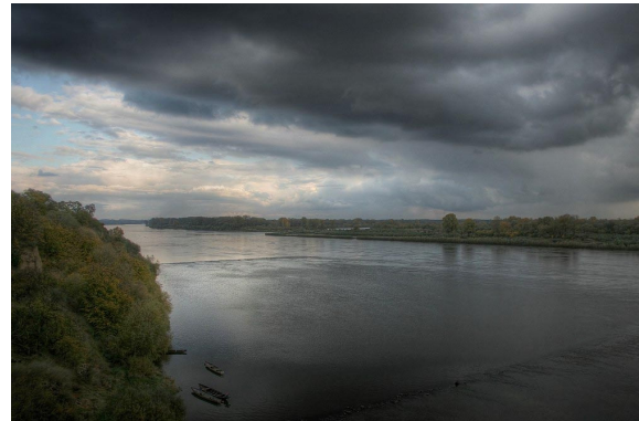
Figure 3. Vistula river near Wyszogród

It was found first in the upper Danube in 1992 (Nesemann et al. 1995), then recorded in the lower Rhine River from where it has spread into the other parts of Western and Central Europe (Bij de Vaate and Klink 1995; Bij de Vaate et al. 2002). The species was recorded in the Oder river in 1999 (Gruszka 1999; Müller et al. 2001; Jażdżewski et al. 2002) downstream of the