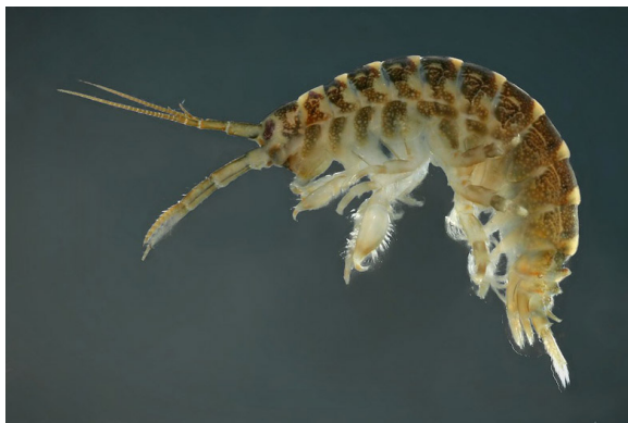
Figure 2. Dikerogammarus villosus (alive specimen, photograph by Michał Grabowski)

The newest coloniser, Dikerogammarus villosus (Sowinsky, 1894) (Figure 2), originates from the lower courses of large rivers in the Black and Caspian Sea basins (Mordukhai-Boltovskoi 1969). It has spread to Western